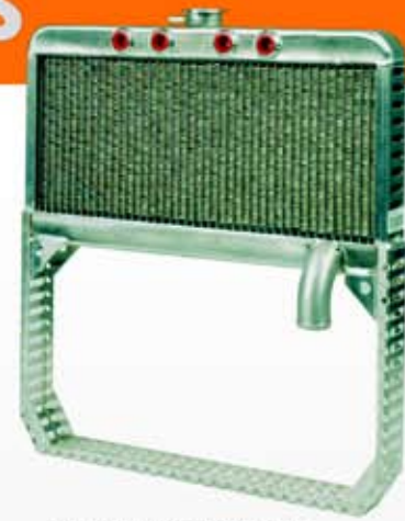
Lightweight Sprint Qualifier