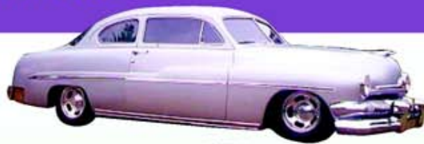
1951 Mercury