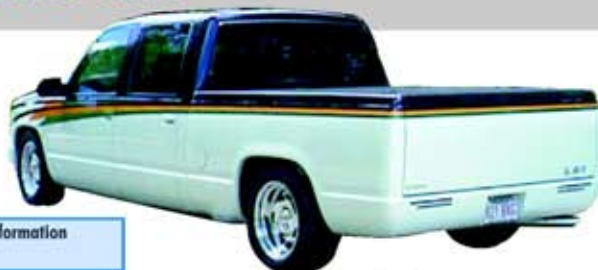
Chevy Truck

FEATURES 2 row, 1.25" Tubes, up to 600 Hp 2 row, 1.0" Tubes, up to 400 Hp Trans Cooler Engine Oil Cooler