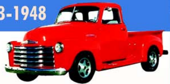
1948 Chevy Truck