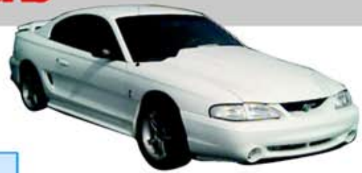
1995 Mustang