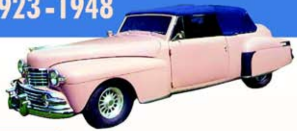
1948 Lincoln