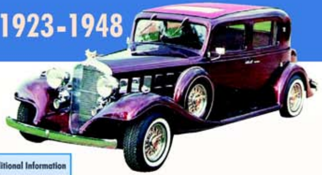
1933 Buick