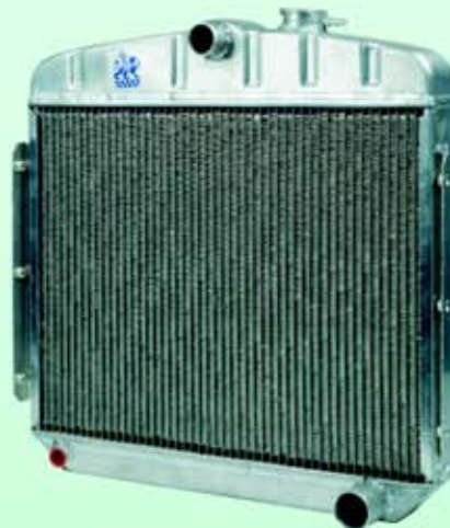
1955-56 Chevy 6 Cylinder mount

IS YOUR CLASSIC CAR NOT LISTED? The Griffin Catalog only lists the most popular radiators. If you don't see your model or application, call Team Griffin. Because we manufacture every component of a Griffin radiator, we can make a Griffin radiator for your exact needs. Call 1-800-722-3723.