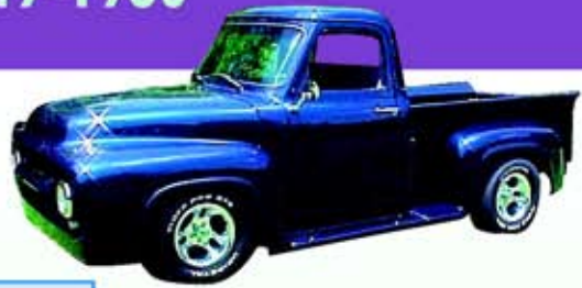
1954 Ford Truck