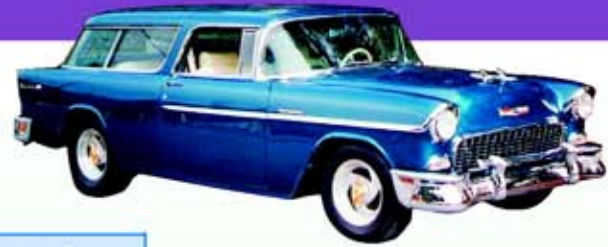
1955 Nomad