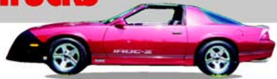
1987 Camaro