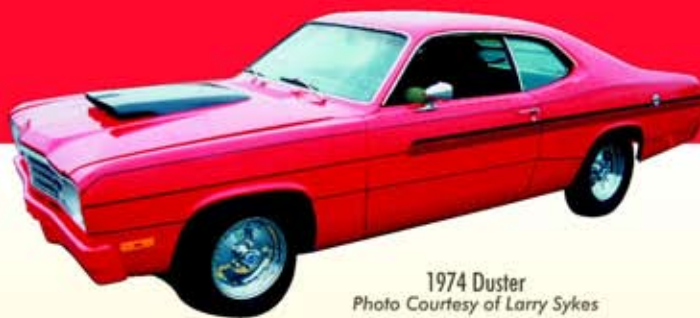
1974 Duster