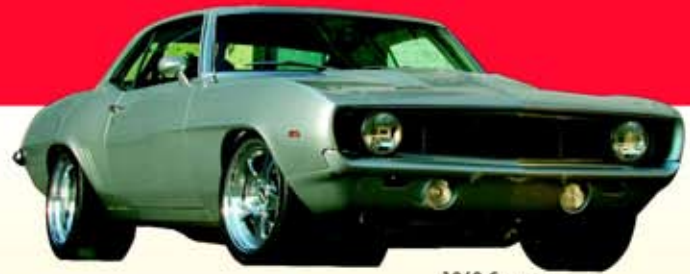
1969 Camaro