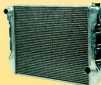
Universal Fit Race Radiator

To Order Call 1-800-RACERAD * 864-845-5000 * Fax 864-845-5001 *www.griffinrad.com*