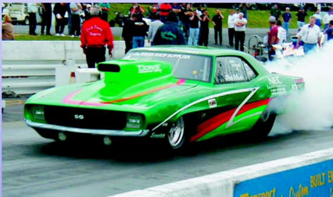
1969 Camaro