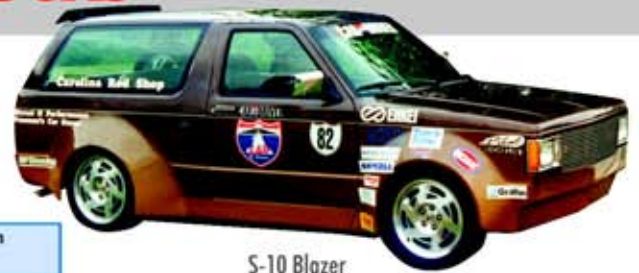
S-10 Blazer