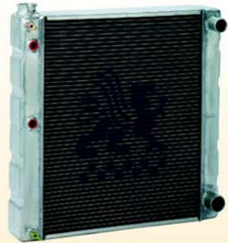
Double Pass Right, with Power Steering Reservoir