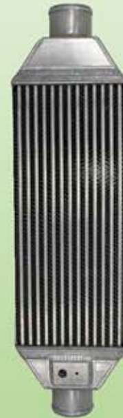
Lotus Exige Custom

Griffin Intercoolers are 100% Custom They are made from high grade aluminum and utilize micro extruded tubes for less pressure drop allowing more boost and better performance.