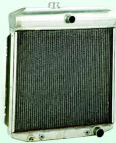
1953-56 Ford Truck

DON'T SEE YOUR CAR OR TRUCK? CALL 1-800-722-3723. TEAM GRIFFIN CAN BUILD YOUR EXACT YEAR, MAKE AND MODEL.