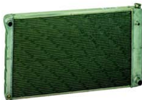
1988-91 Chevy Suburban

DON'T SEE YOUR CAR OR TRUCK? CALL 1-800-722-3723. TEAM GRIFFIN CAN BUILD YOUR EXACT YEAR, MAKE AND MODEL.