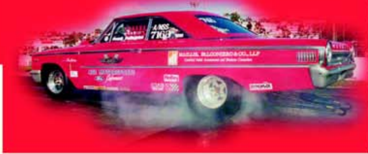
1963 1/2 Galaxie - 422 Motorsports