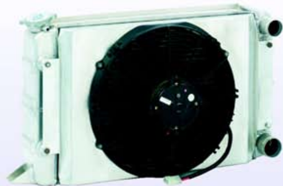
22 x 13, Scirocco Modular with Fan & Shroud