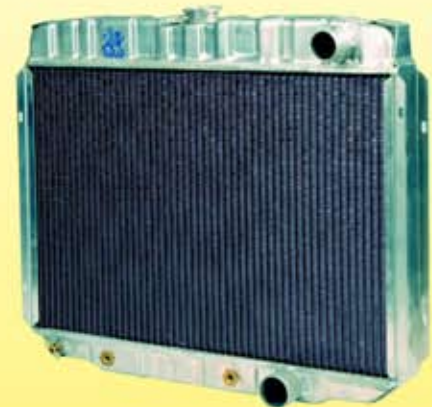
1967 Mustang - 23" Wide