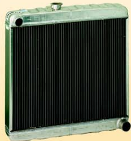
Downflow, Top Left-Bottom Right

Dirt Modified, Bicknell Racing Products Matt "Superman" Sheppard