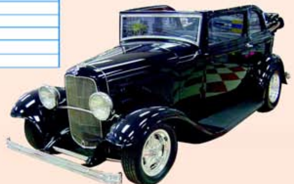
1932 Ford

DON'T SEE YOUR CAR OR TRUCK? CALL 1-800-722-3723. TEAM GRIFFIN CAN BUILD YOUR EXACT YEAR, MAKE AND MODEL.