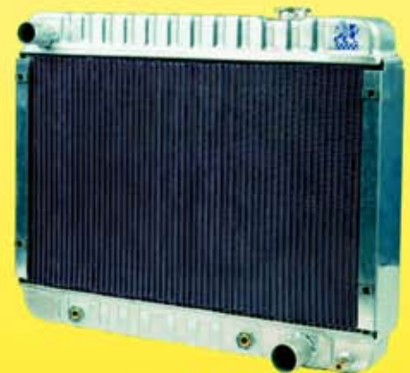
1966-67 Chevy Nova - 25 1/2" Wide

DON'T SEE YOUR CAR OR TRUCK? CALL 1-800-722-3723. TEAM GRIFFIN CAN BUILD YOUR EXACT YEAR, MAKE AND MODEL.