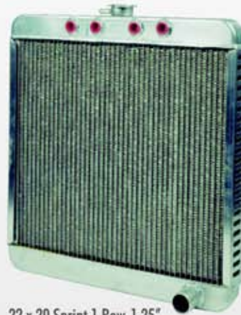
22 x 20 Sprint 1 Row-1.25"

Sprint Car, Kreitz Oval Track