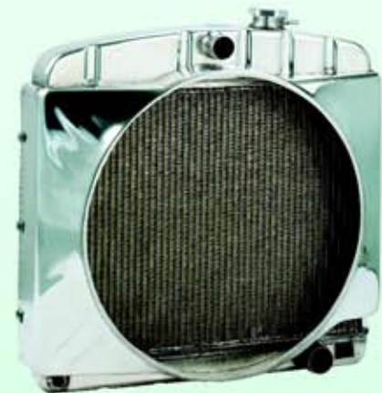
1955-57 Chevy V8 Mount with Shroud

DON'T SEE YOUR CAR OR TRUCK? CALL 1-800-722-3723. TEAM GRIFFIN CAN BUILD YOUR EXACT YEAR, MAKE AND MODEL.