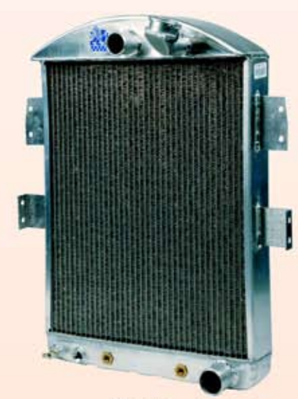
1934, 35 Chevy Standard

DON'T SEE YOUR CAR OR TRUCK? CALL 1-800-722-3723. TEAM GRIFFIN CAN BUILD YOUR EXACT YEAR, MAKE AND MODEL.