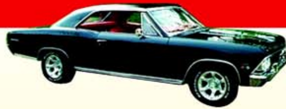
1966 Chevelle