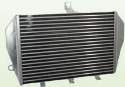
Mitsubishi Evo Custom