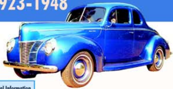
1940 Ford