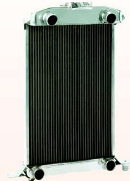
1937, 38, 39 Ford Standard With Flathead Outlets