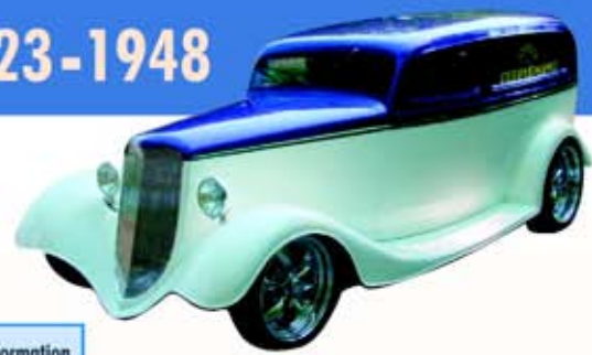
1933 Ford