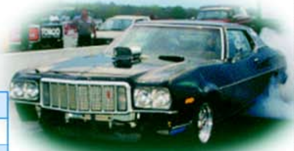
Ford Torino