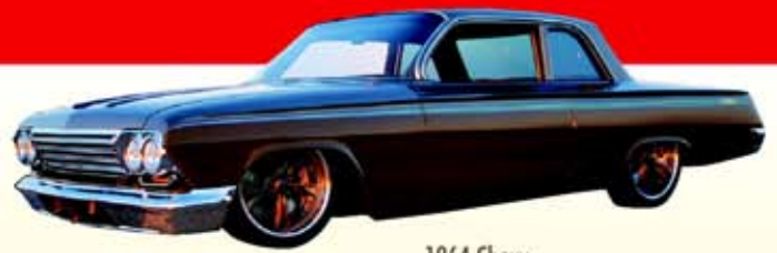
1964 Chevy Rad Rides By Troy