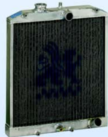
1992-2000 Honda Civic